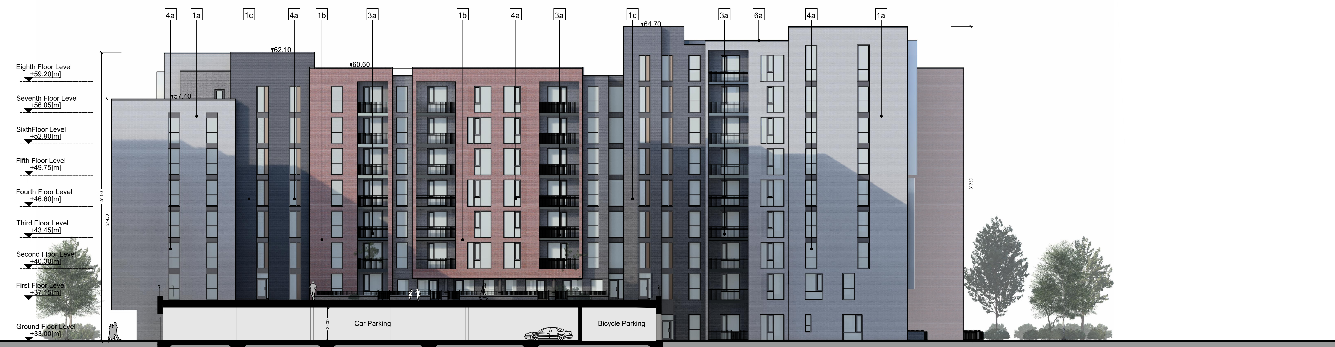
02 - West Courtyard Elevation - Block 3 Scale 1:200 @A0

Note: 1.8mm high glass balustrade can be provided on the upper level balconies if required by the Planning Authority.