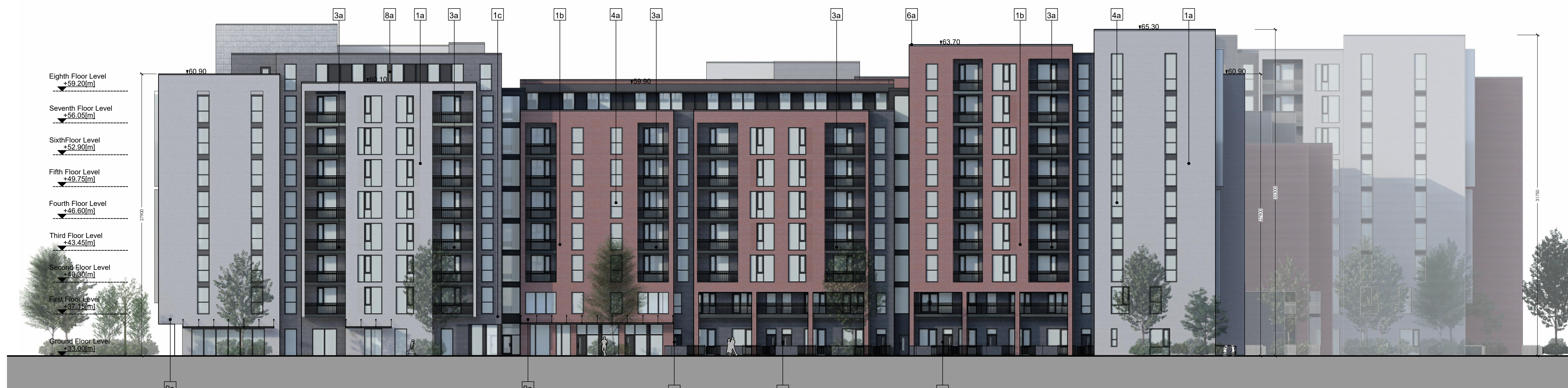
01 - West Elevation - Block 3 Scale 1:200 @A0