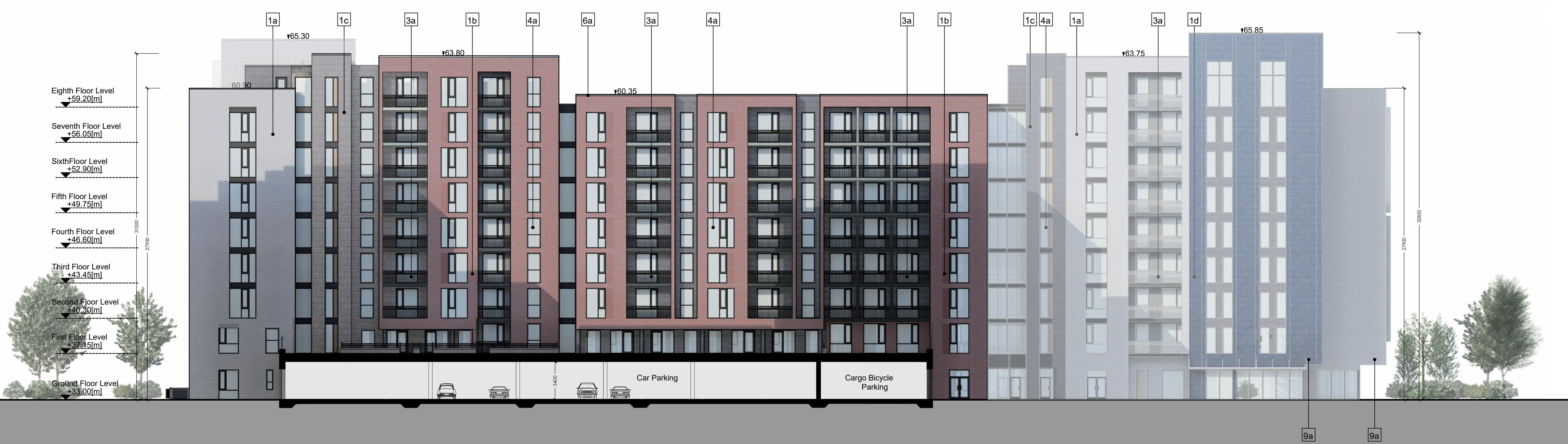
03 - East Courtyard Elevation - Block 3 Scale 1:200 @A0